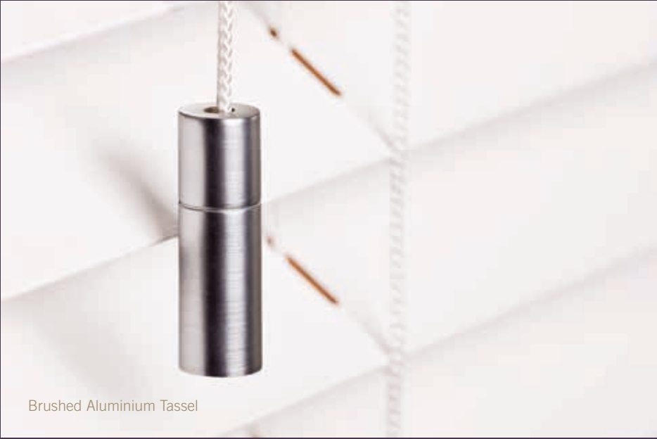
Brushed Aluminium Tassel