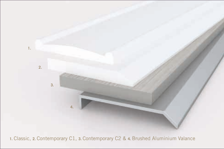
1. Classic, 2. Contemporary C1, 3. Contemporary C2 & 4. Brushed Aluminium Valance