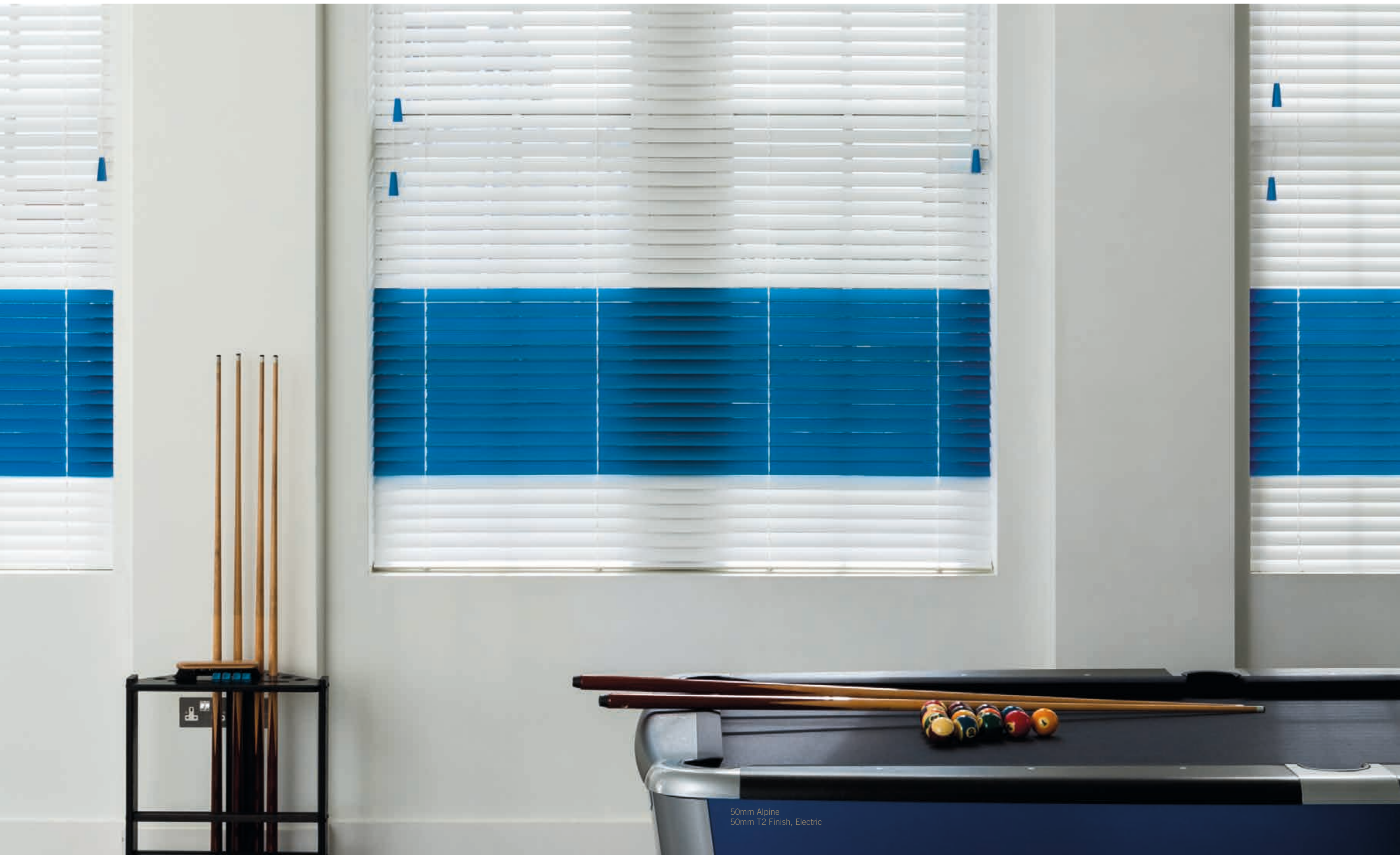
50mm Alpine 50mm T2 Finish, Electric