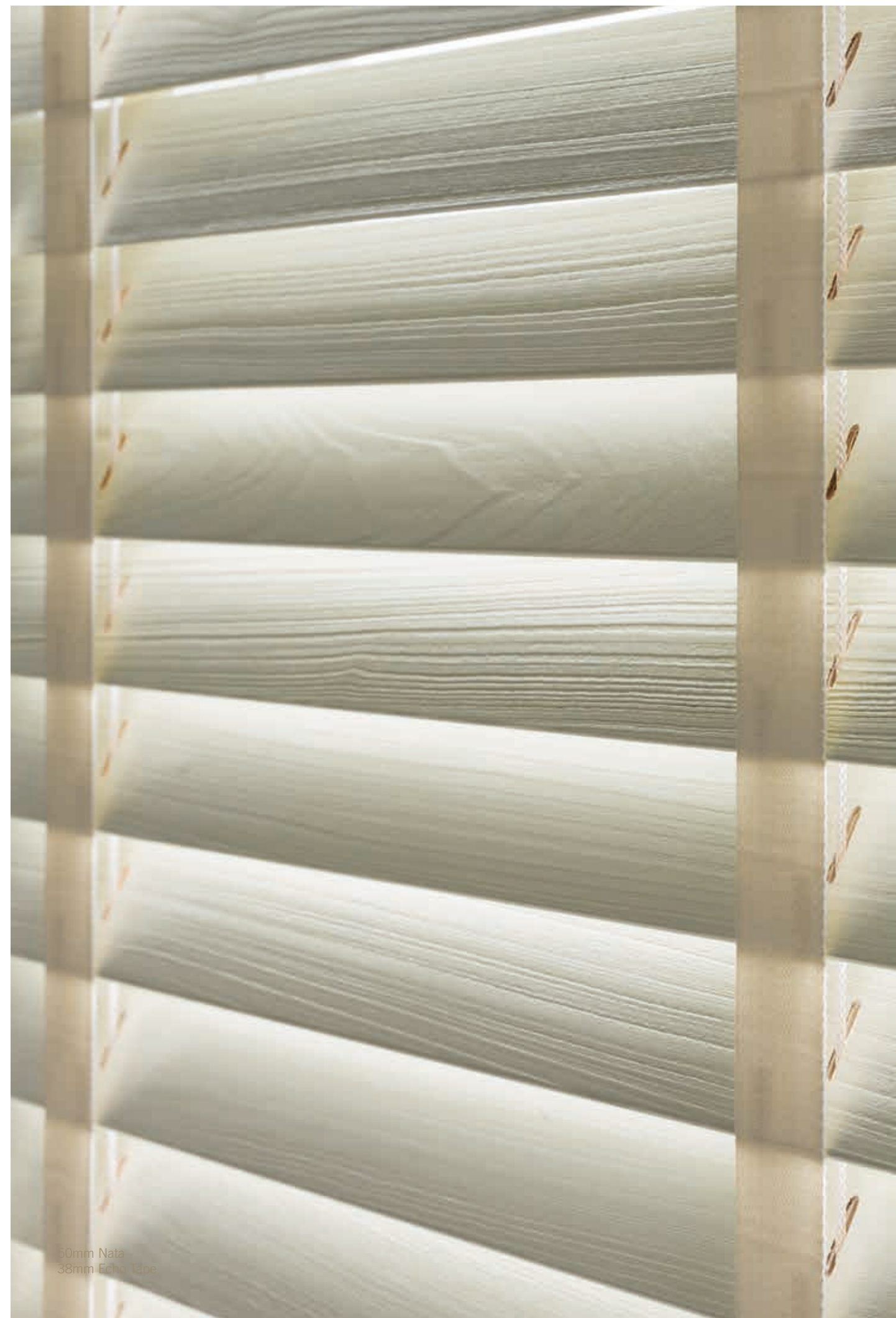
50mm Nata 38mm Echo Tape