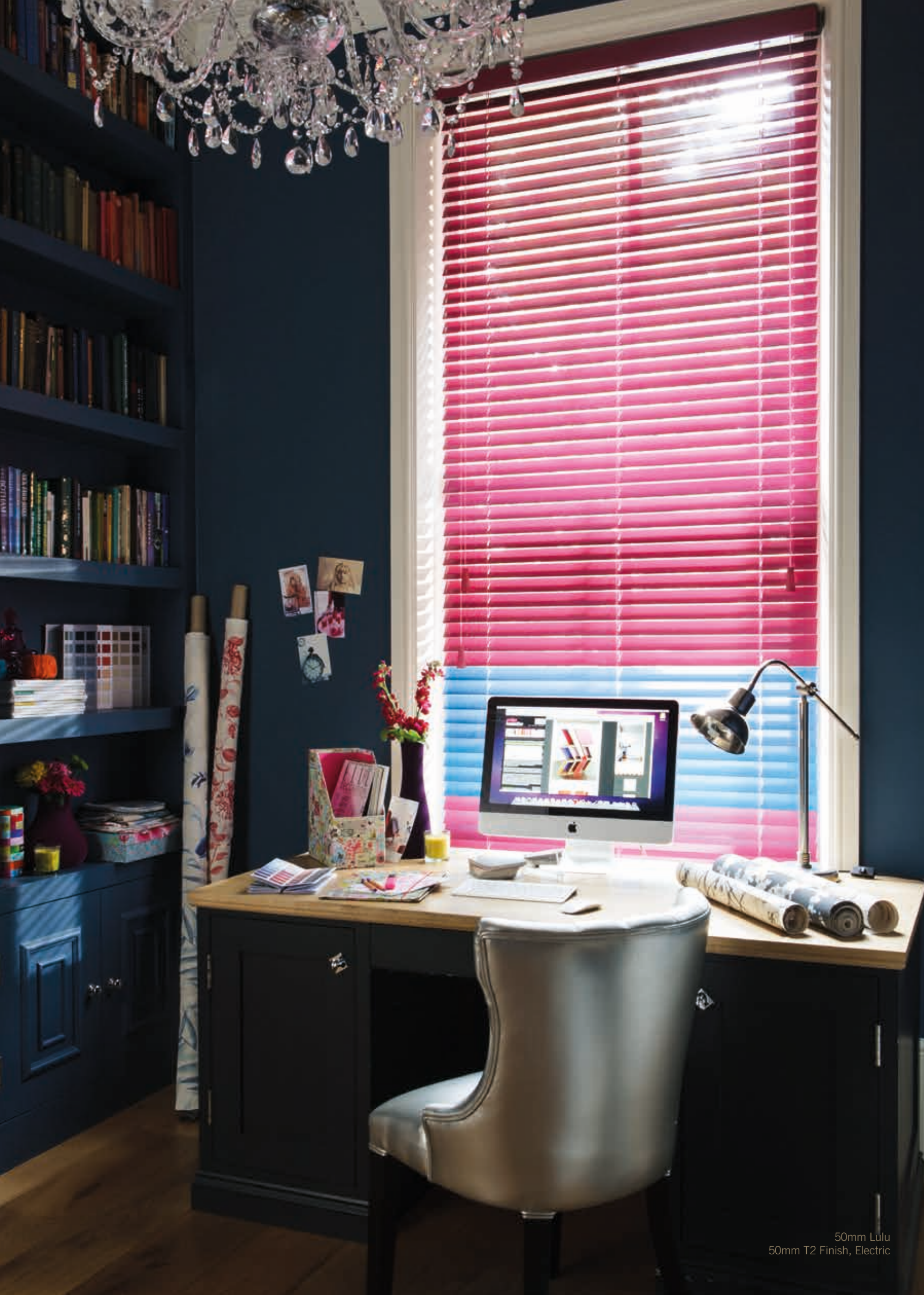
50mm Lulu 50mm T2 Finish, Electric