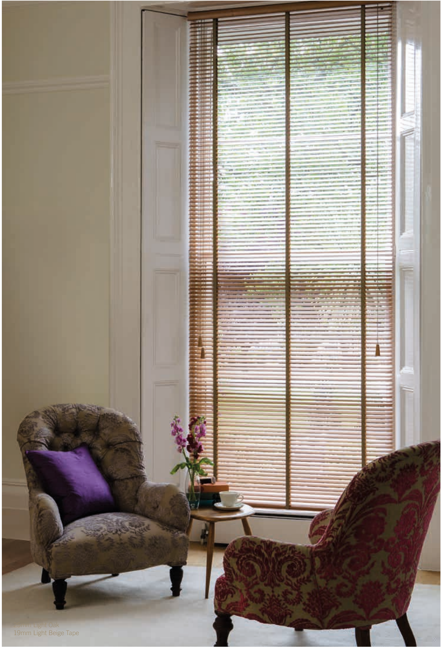
25mm Light Oak 19mm Light Beige Tape