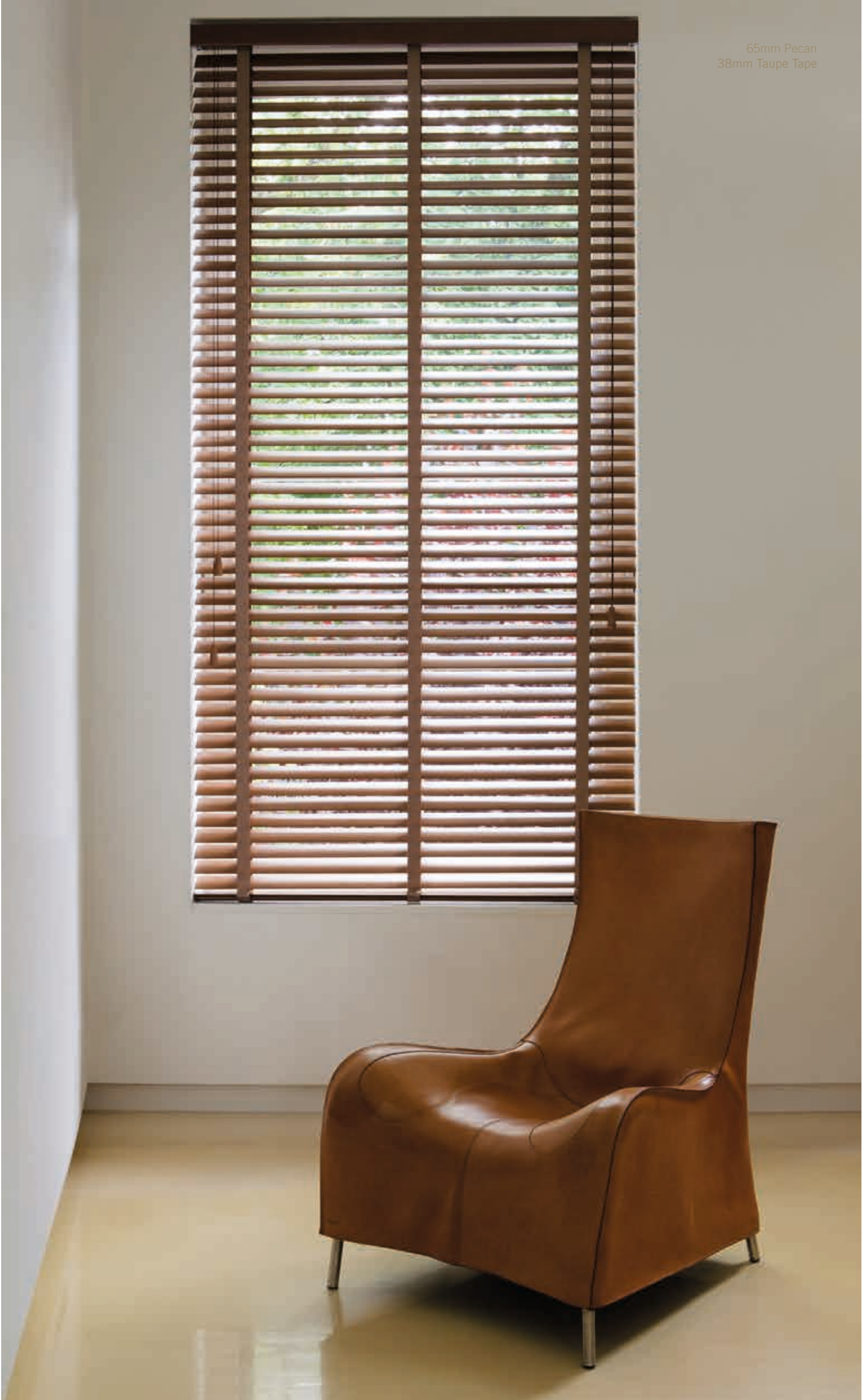
65mm Pecan 38mm Taupe Tape