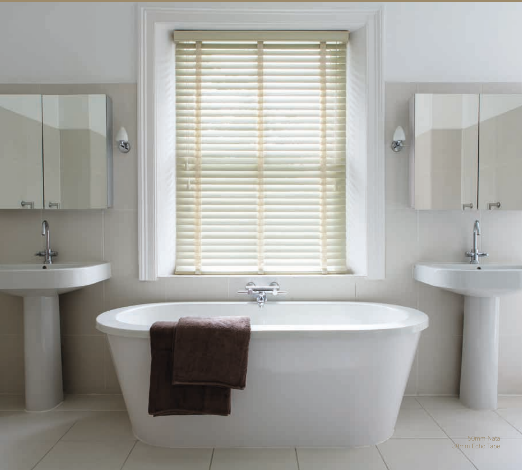
50mm Nata 38mm Echo Tape