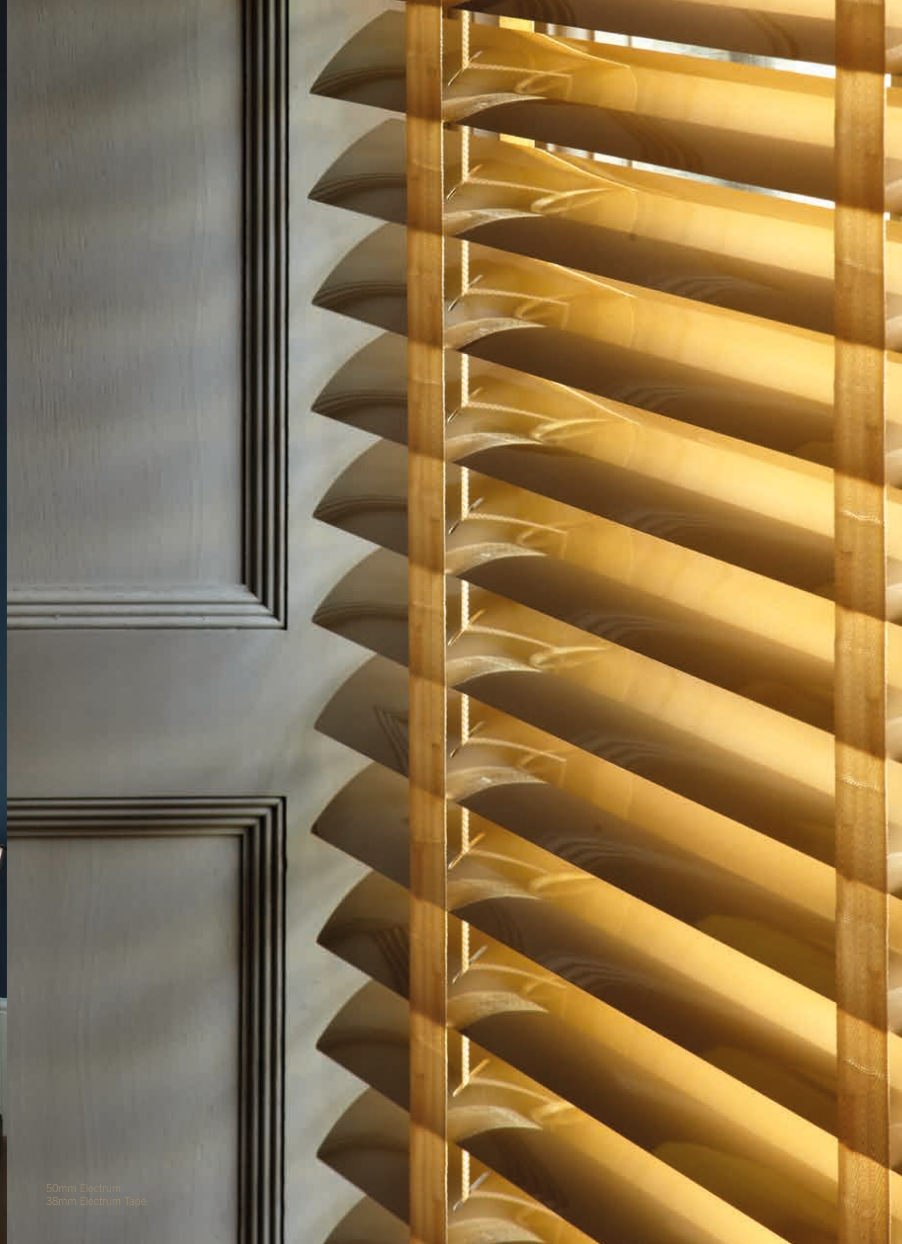
50mm Electrum 38mm Electrum Tape